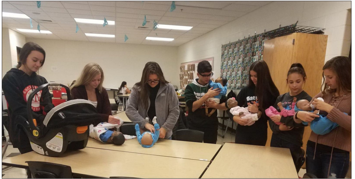
Child Development students working with the demonstration babies

The Teacher Cadet course is a full year 2-hour block class that has the students studying all facets of education and child care services through online research, observation, and a field experience. The field experience has the students working in a middle school and elementary classroom throughout the school year. The cadet student works with the stu-